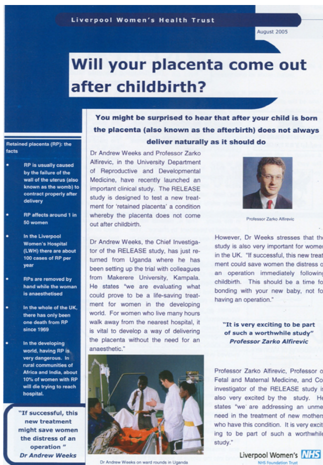
Figure 1 Front cover of the Release study newsletter.

All the above publicity is provided to raise awareness of the trial antenatally and give women the option of obtaining more information if they wish.